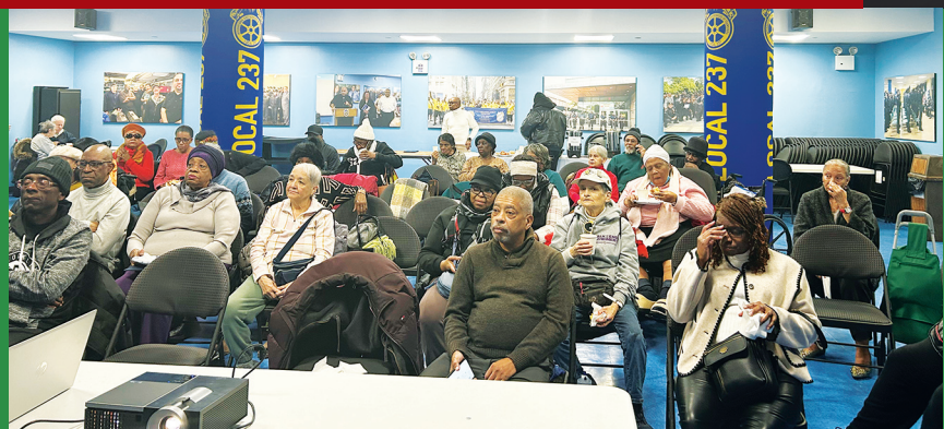
Retirees participating in the Dr. King event.